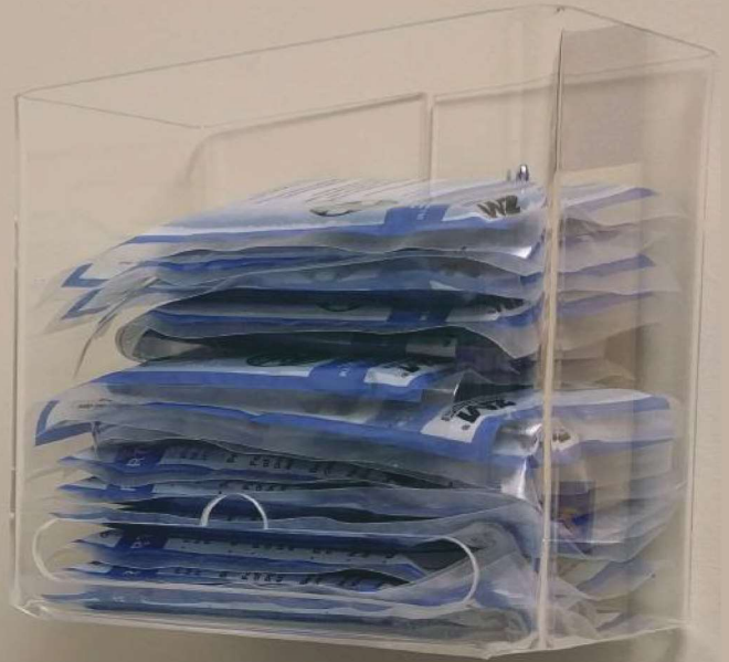
Z-Sponge Holder (20 Count)