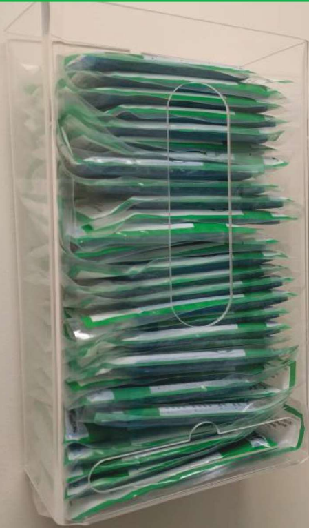
Z-Sponge Holder (40 Count)